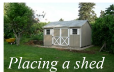
Placing a shed